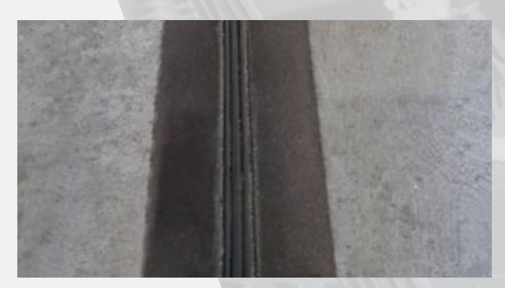
Wizflex between Silspec 900 PNS