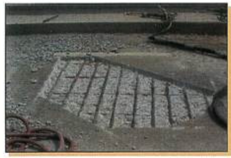
Step 2: Thoroughly clean patch area by grit blasting. Any exposed reinforcing steel shall be blasted to white metal finish.