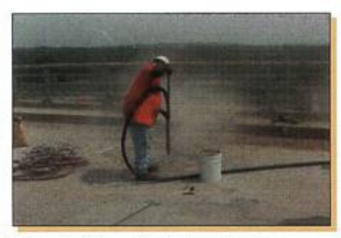
Step 3: Blow all dust and loose particles from patch area with oil / moisture free compressed air.