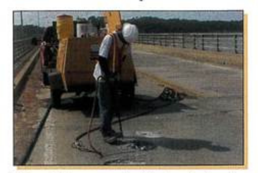
Step 1: Remove all deteriorated and unsound concrete with chipping hammers not to exceed 15kg.