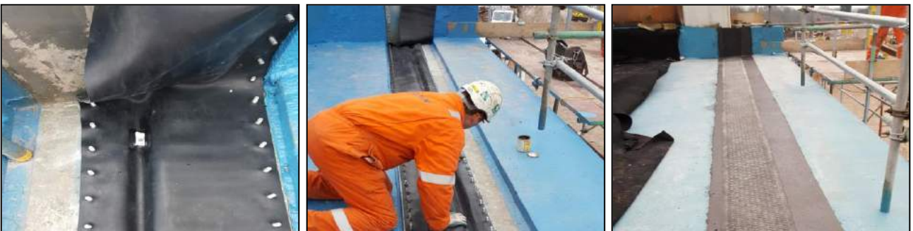
Ekspan T-Mat 130 Expansion Joint and upstand installed on A6 Hazel Grove Bridge, Stockport.