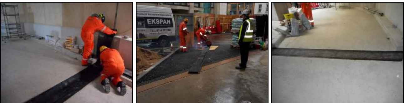
Ekspan T-Mat 80 Expansion Joint and upstand installed at Selfridges, London.