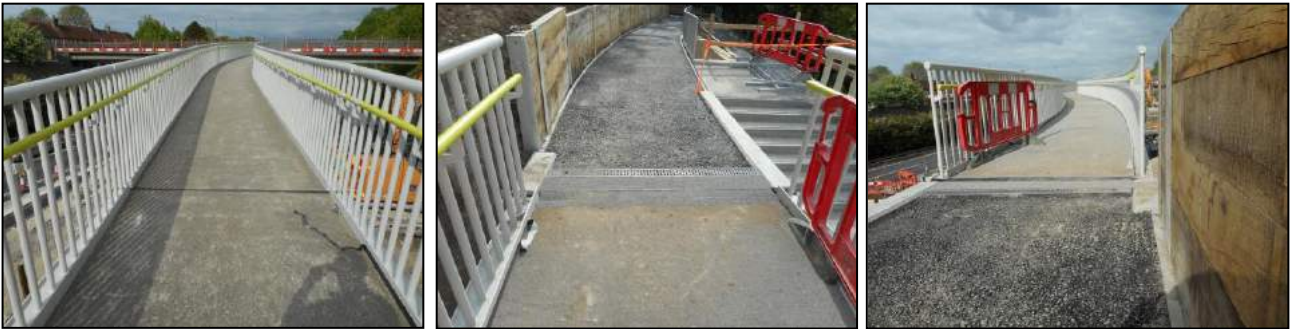
Ekspan T-Mat 80 & Ekspan T-Mat 30 Expansion Joint installed on Falmer Footbridge, Brighton.