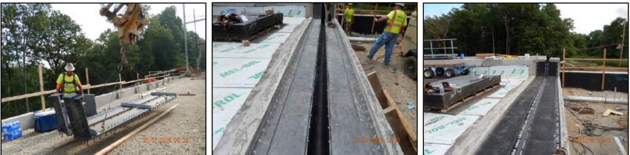
Ekspan T-Mat 260 Expansion Joint installed on the Crum Creek Project, Philadelphia.