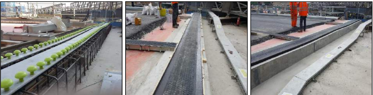
Ekspan T-Mat 130 Expansion Joint installed on Halo Bridge - Bateria Power Station project, London.