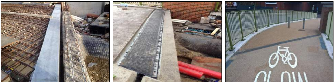
Ekspan T-Mat 80 expansion joint installed on Castfields Services Bridge, Manchester