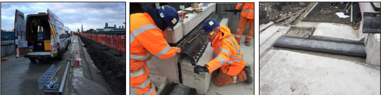
Ekspan T-Mat 80 expansion joint, Ekspan EW45 and Ekspan ES seal installed on Bermondsey Dive Under, London.