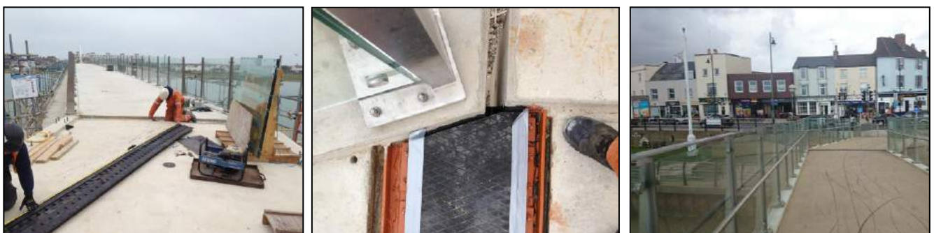
Ekspan T-Mat 80 expansion joint installed on Shoreham Harbour Footbridge, West Sussex