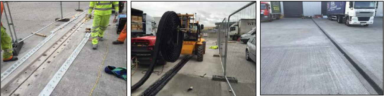
Ekspan T-Mat 30 expansion joint installed on X2 Hatton Cross, London