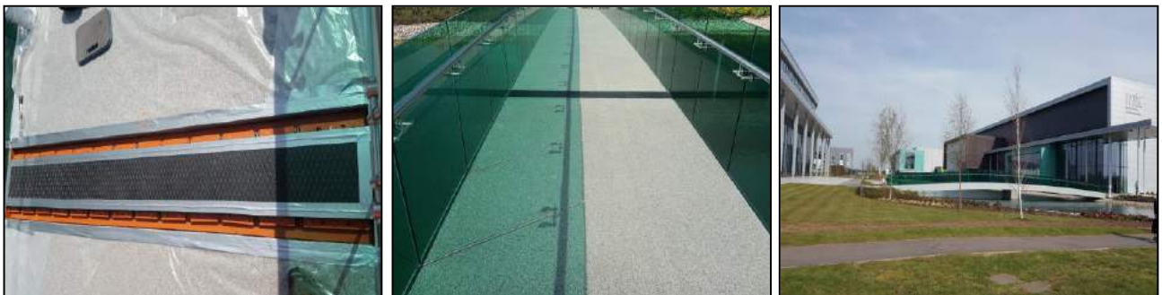
Ekspan T-Mat 80 Expansion Joint installed on Coventry Arc Footbridge – Manufacturing and Technology Centre