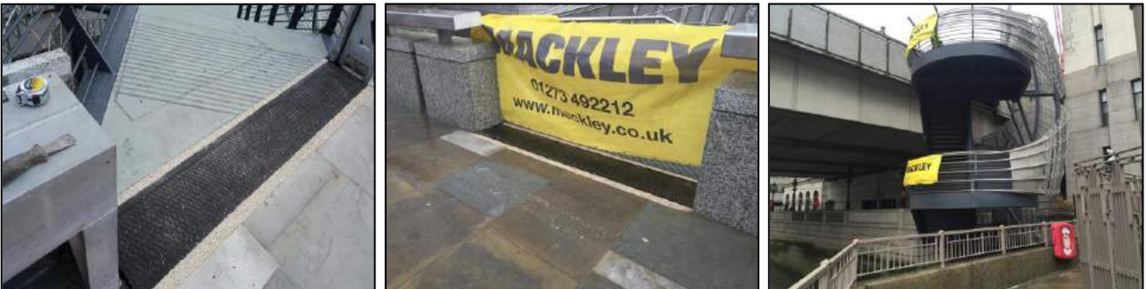
Ekspan T-Mat 130 Expansion Joint installed on the new London Bridge Staircase.