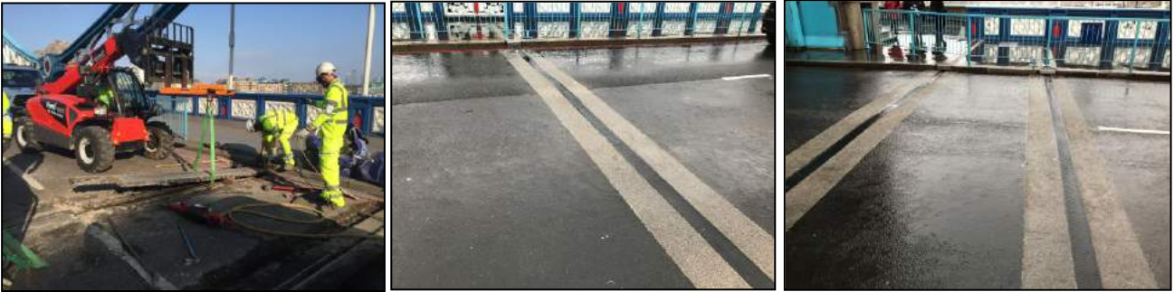
Ekspan T-Mat 30 Expansion Joints installed on the Tower Bridge refurbishment Project, London.