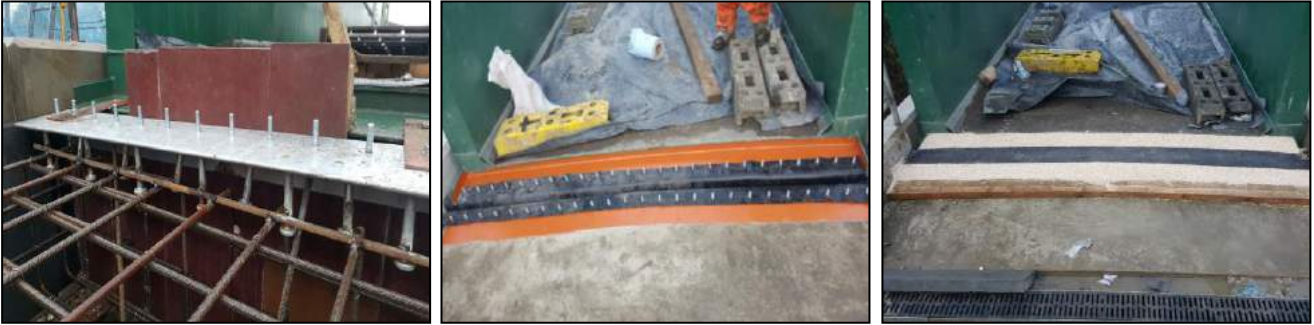
Ekspan T-Mat 30 expansion joint installed on Holytown Footbridge, Motherwell