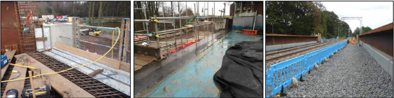
Ekspan T-Mat 130 Expansion Joint installed on Crewe Green Rail Bridge, Cheshire.